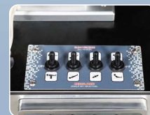
Manual Override System Control