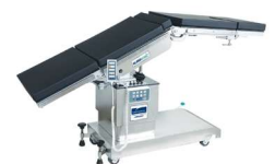
Lateral Thorax Position for Kidney and Thoracic Surgery