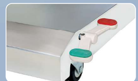
Twin Disk Castors with Central Locking Lever 2 Swivelling and 2 Fixed

Surgical procedures has become customizable with optimized workflow, improved efficacies yet cost-effective measures resulting in maximized profitability. Surgistar Electric Operating Table systems are unmatched in versatility, with detachable and interchangeable head and Leg sections for various surgical procedure, including radio translucent table top that offers outstanding C-arm imaging/ fluoroscopy. Surgistar tables can be adapted to the desired operating environment and are capable of communicating with C-Arm systems to provide the ultimate in imaging and surgical performance. With unmatched adaptive positioning options, Surgistar facilitates seamless patient positioning and improves ergonomics for the surgical team.