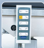
User Friendly Handset