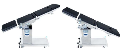
Trendelenburg / Reverse Trendelenburg

Surgistar provides state-of-the-art solutions for cutting-edge, configurable surgical table systems. Surgistar multifunctional OT Tables enable flexible OR function for both minimally invasive and open surgical procedures.