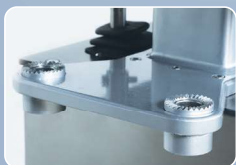
Provision for Ortho Attachment

MULTI PURPOSE ELECTRO-MECHANICAL OPERATING TABLE