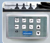
Auxiliary Control on Column