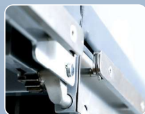
Railings with Locking System for Safety