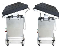
Lateral Tilt (Left / Right)